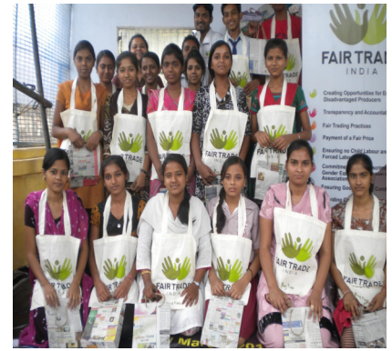
Re-cycled paper bag making workshop in No. 10 School.