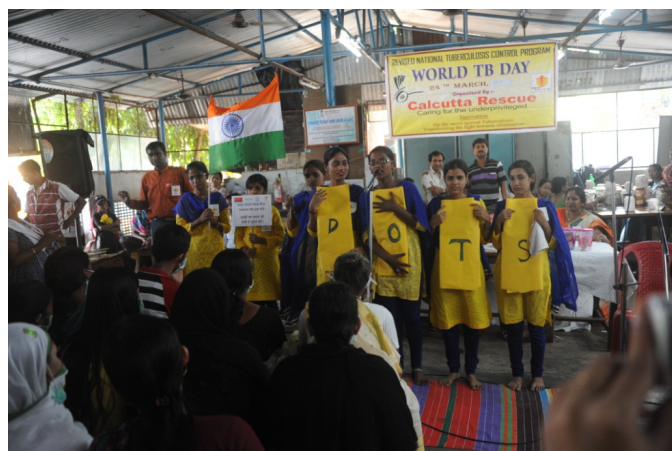
Patients performing a street play on World TB day

World Tuberculosis Day was observed on 24 th March 2015 with 60 DOTS and MDR-TB patients. The local councilor and District Tuberculosis Officer were also present in this program. On this day Quiz program was conducted and a street play was performed by some of the cured patients. Gifts and Refreshment packets were distributed among the patients present and those performing the street play.