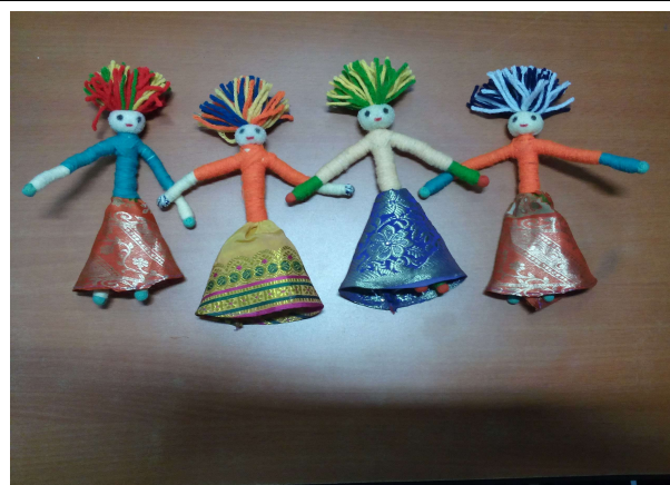
Magnetic Crazy doll