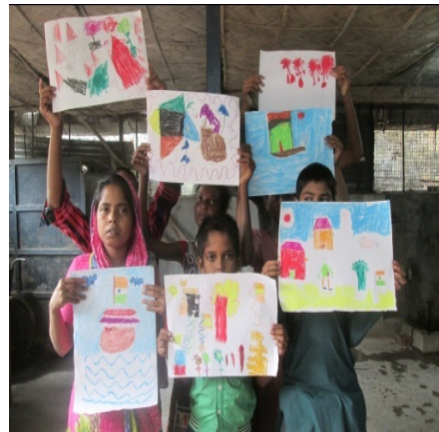
Sit and draw competition