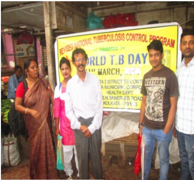
Road Play on World TB Day