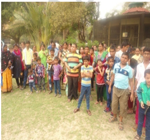
Visiting to Zoo