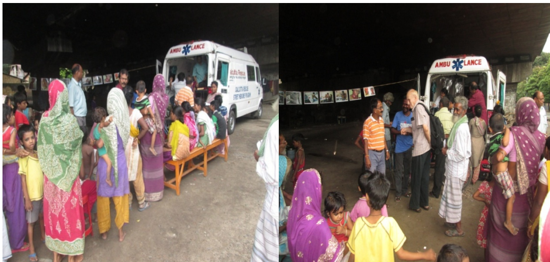
Street Medicine Program in Ambulance at Hasting