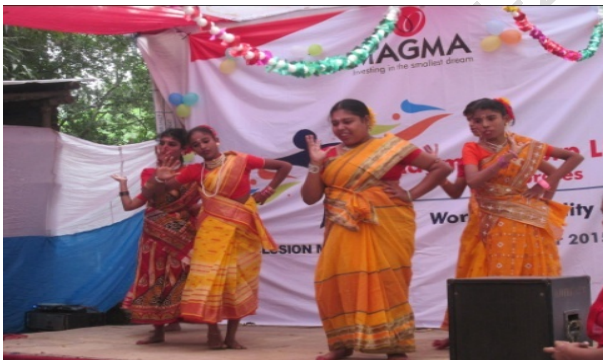
Celebration of World Disability Day